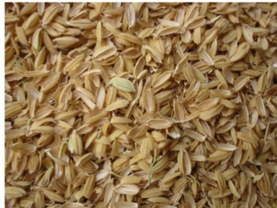
Fig 1. The rice husk

In addition there is an alternative energy source that may be less known, namely biomass. The biomass is one of alternative energy to generate electrical power [2]. The rice husk is a biomass type with very abundant availability in South Sulawesi, Indonesia.